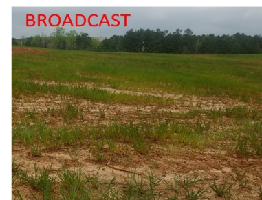
NO-TILL SEED DRILL

Compare the results of the same Pickens County farm planted using a No-Till Drill versus Traditional Broadcast Planting.